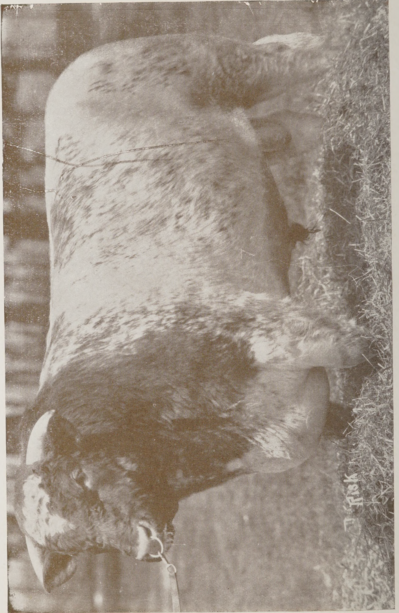
Village Supreme 423865 by Sultan Supreme by Double Dale, out of dam by Imp Villager.